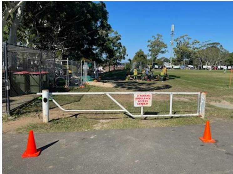
Large cones in front of the emergency gate access.