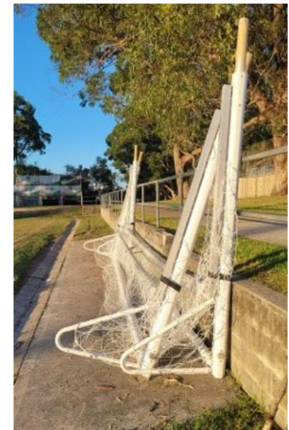
Goal pack-up along path at western end of GBO2.