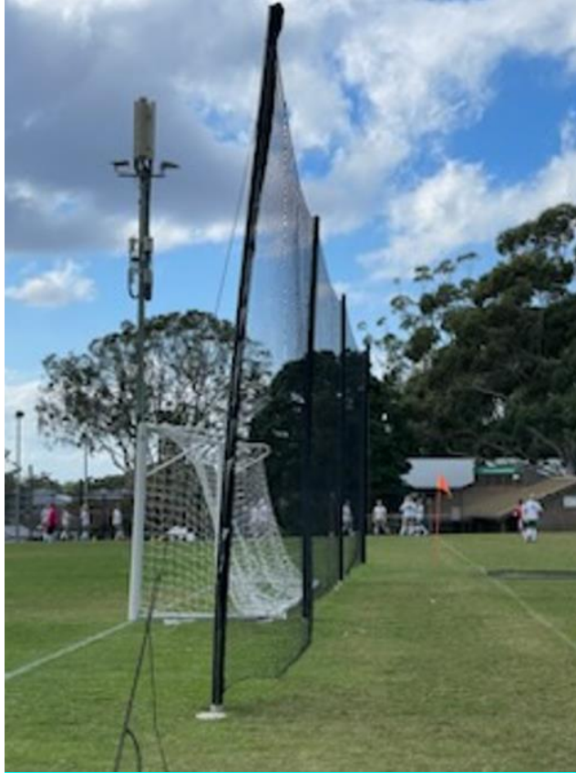
Black field net divider.