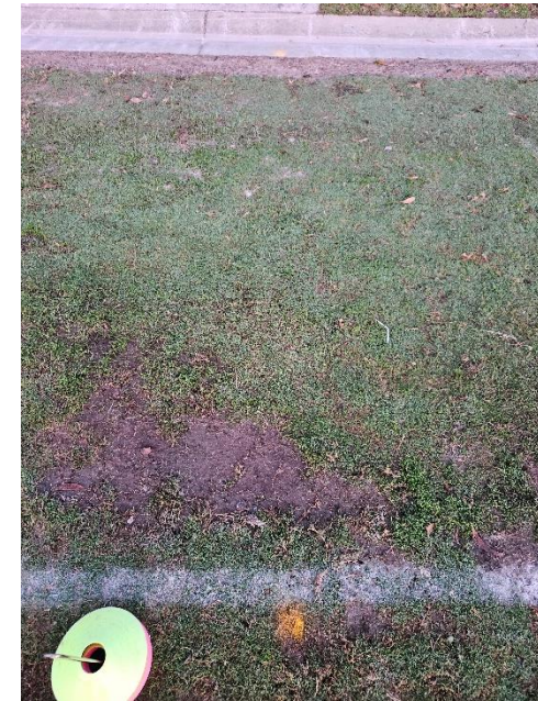
Yellow marker for cone lines.