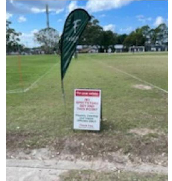
Signage for between fields.