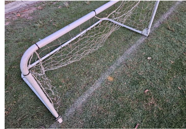
Yellow marker for centre of goal posts.